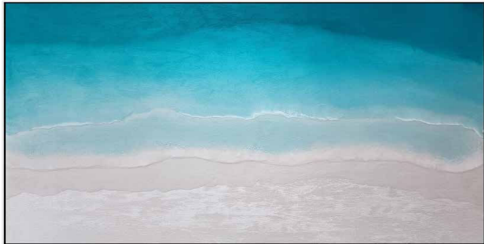
Serenity Resin on Wood 80×120 cm