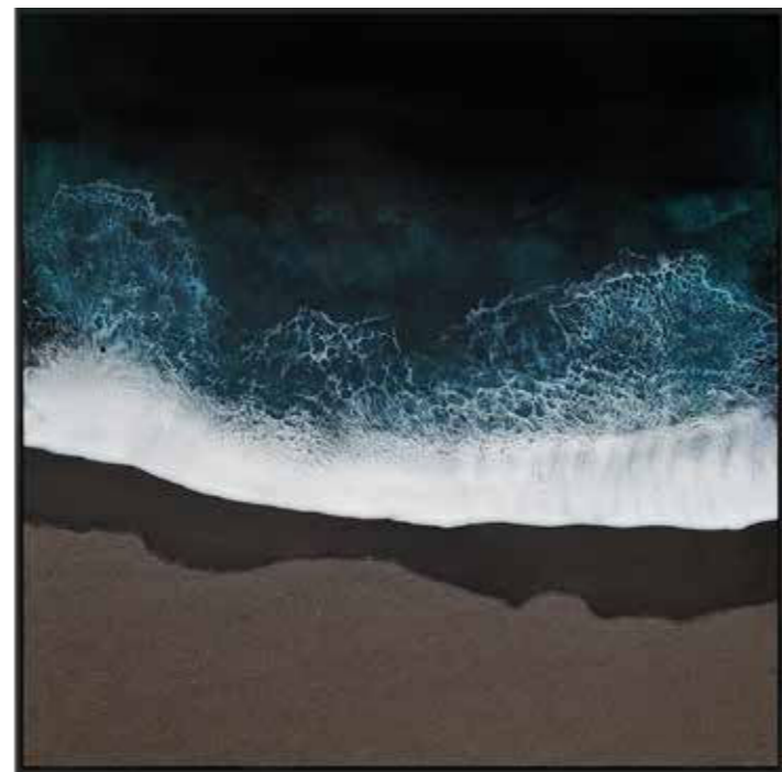
Ocean Blues Resin on Wood 70×70 cm