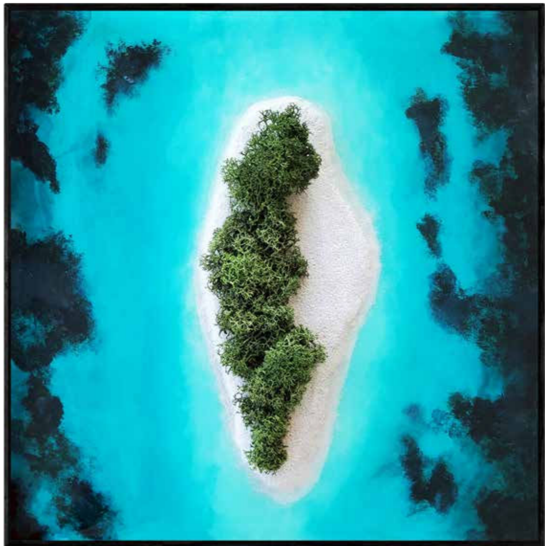
Bliss Isla Resin on Wood 30×30 cm