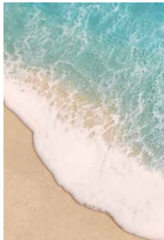
Isla Bonita Resin on Wood 100×100 cm