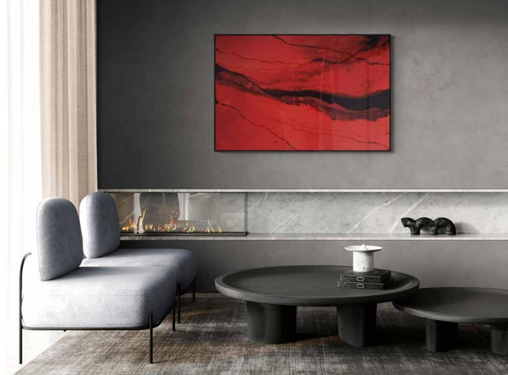
Yūgen Resin on Wood 100×150 cm