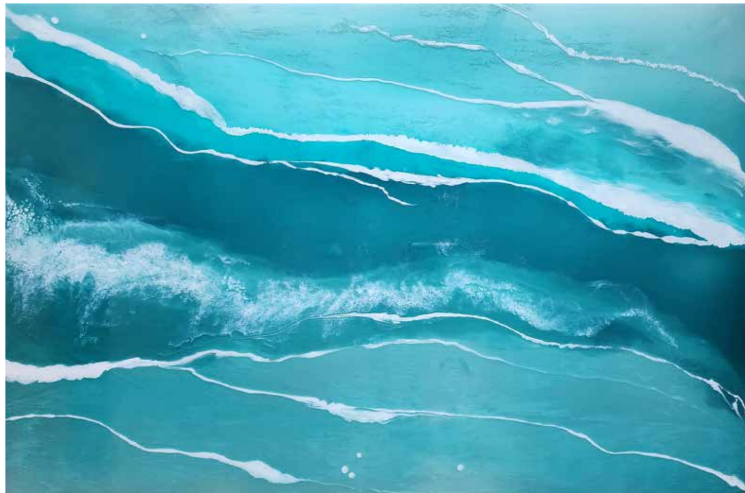
Marine Mystery Resin on Wood 80×120 cm