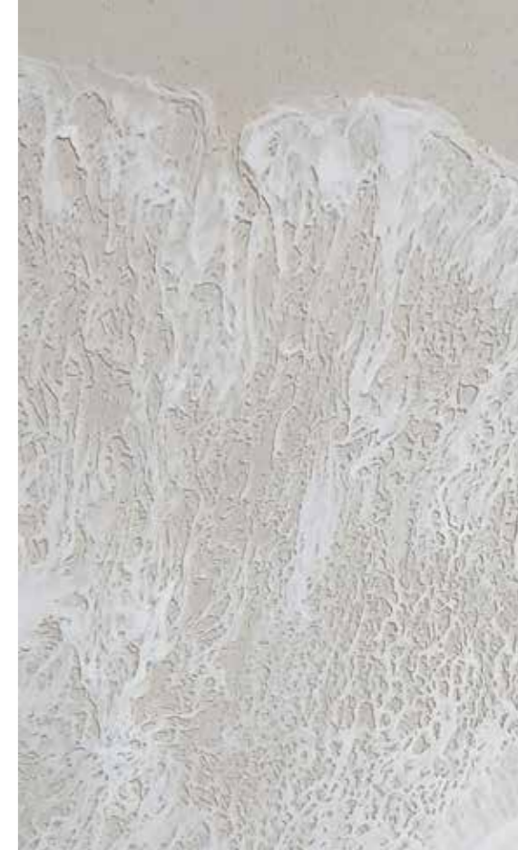
Motion Resin on Wood 92 × 92 cm