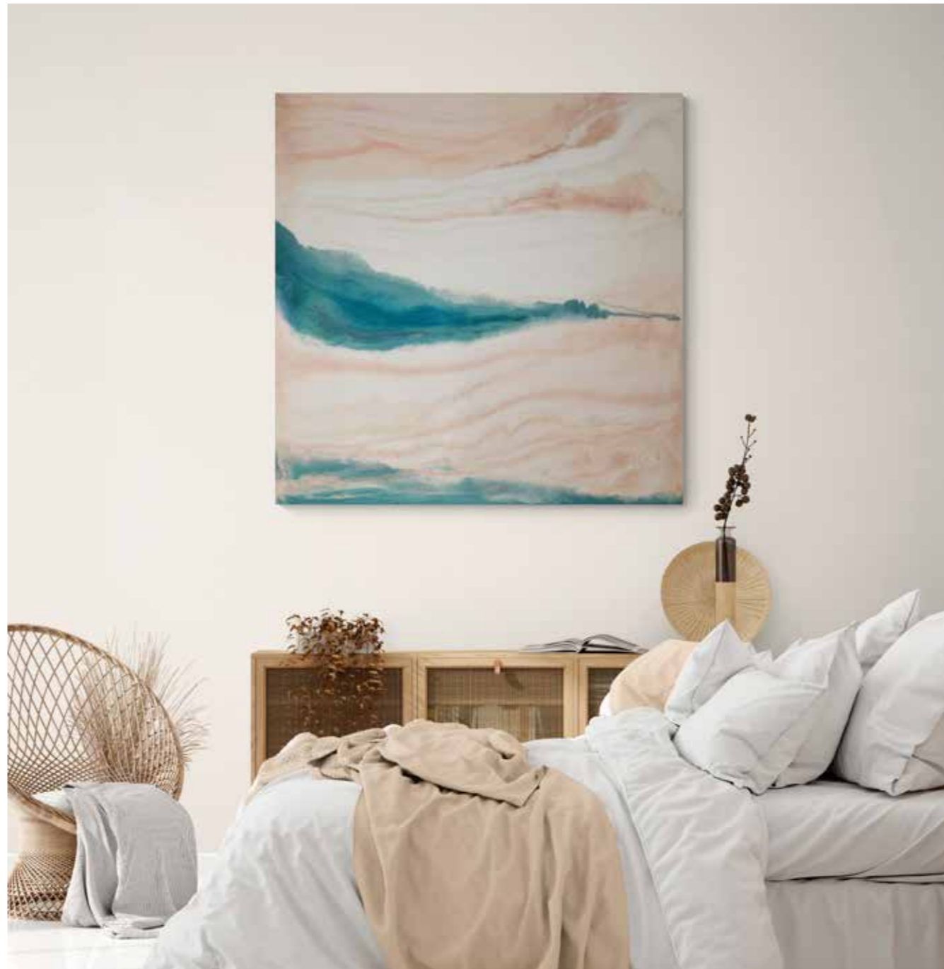
Peachy Resin on Wood 120×120 cm