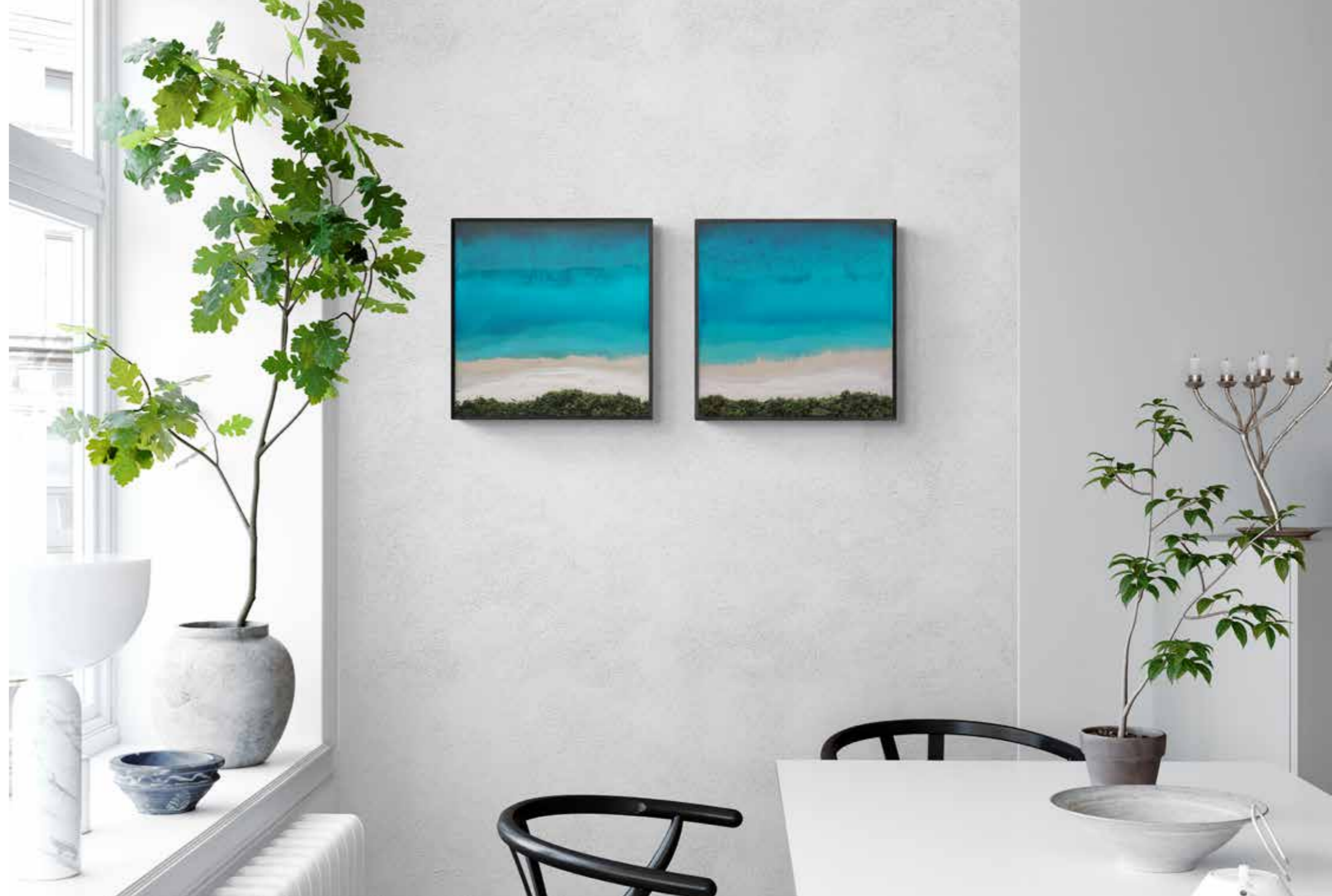
Vivid Mixed Media Resin on Wood 32 × 64 cm