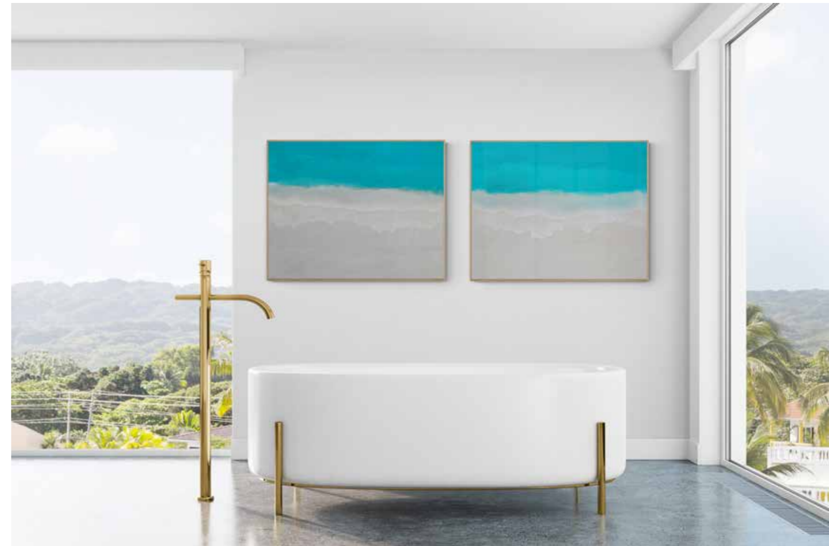
Power Couple Resin on Wood 70×180 cm